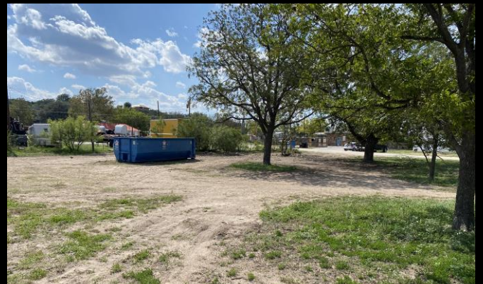
Clean up project on 6 th St.