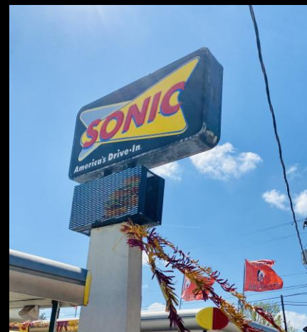
Sonic sign project