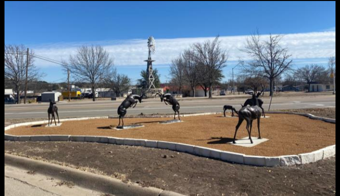
Keep Sonora Beautiful Triangle

For FY 21 -22 the SEDC funded $116,987.00 in projects.